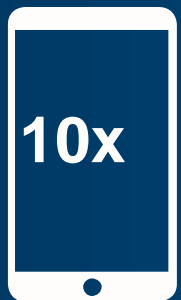
Mobile Data set to grow tenfold by 2022