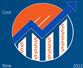
Driving upgrades to enterprise data plans